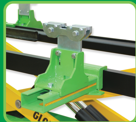
Sill clamp with extension plate for increased space between the vehicle and bench, ideal for use of measuring systems