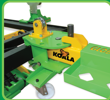
The mounting of the articulated puller is quick, simple and can be attached anywhere around the frame of the Koala