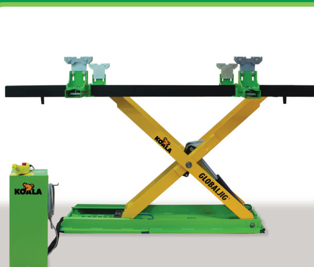
Surpasses other lifts in height: the Koala lifts to 1650 mm