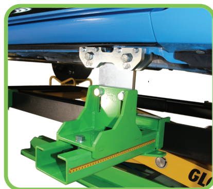
New steel universal sill clamps with free height adjustment, for any type of vehicle with under-floor sill crests.