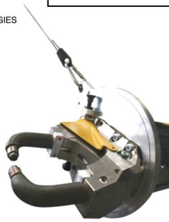
Swivel kit for both X and C gun